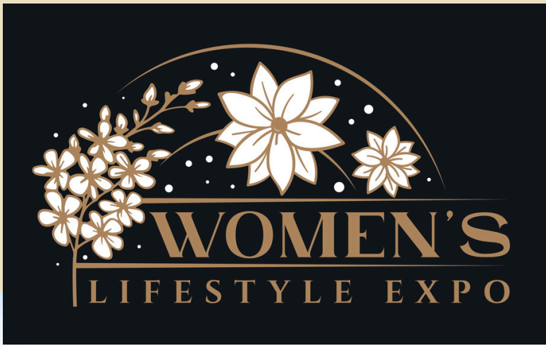
Exhibit With Us FEBRUARY 15 2025 Expo Idaho